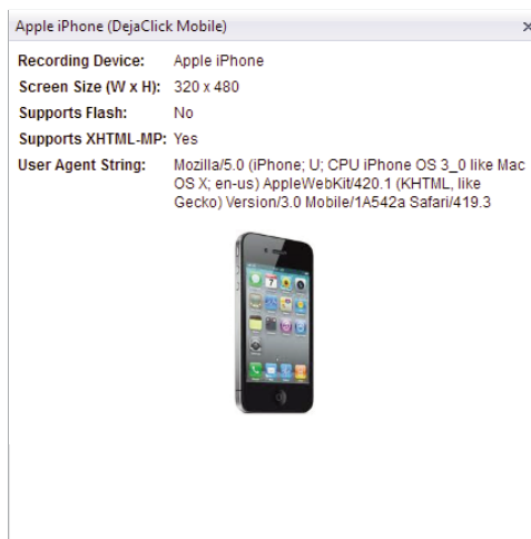
SEE TRUE-TO-SIZE IMAGE OF RECORDING AND PLAYBACK